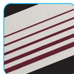
Print onto membranes